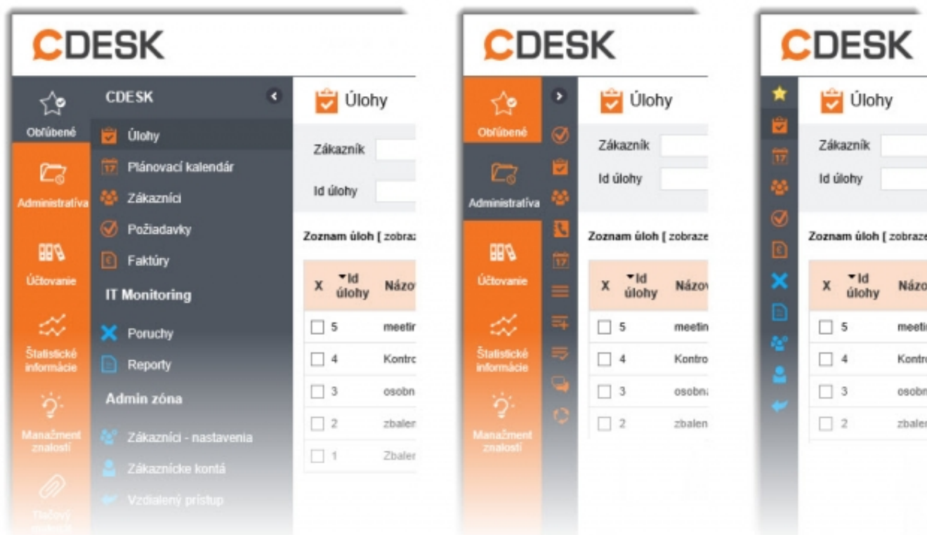
Image: Nové menu - 1.Plná veľkosť 2.Zbalený režim 3.Zbalené Oblíbené